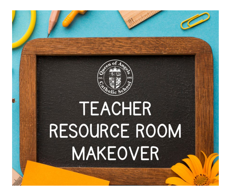
Click the picture to make a donation